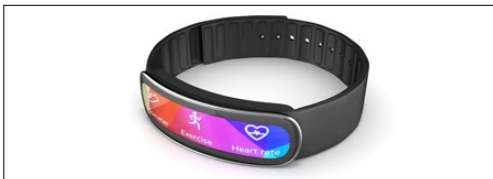
Wearables (smart watches, health monitors, AR & VR)