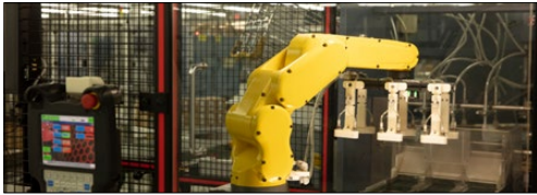
Industrial IoT/robotics & factory automation