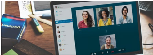
5G networking/telecommunications communication modules (Wi-Fi routers and mesh devices)